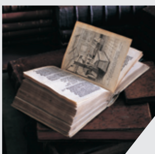
Books and manuscripts 書籍和手稿