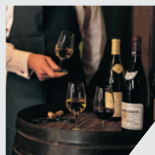
Wine collection 釀酒收藏