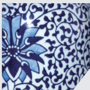
Ceramics and glass 陶瓷和玻璃製品