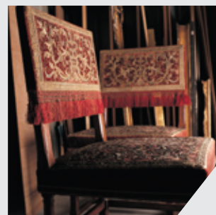
Rugs and textiles 地毯和紡織品