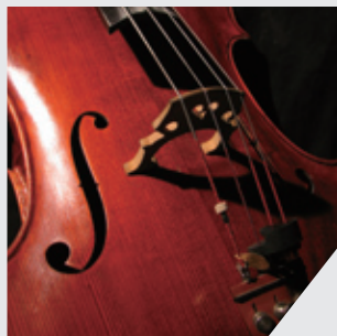
Musical instruments 樂器