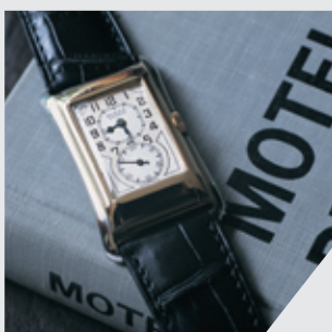
Jewellery and watches 珠寶和手錶