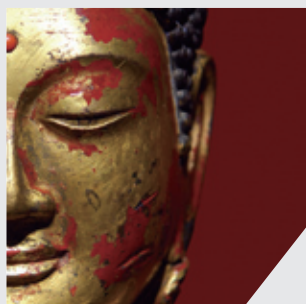
Bronzes and sculpture 銅製品和雕塑